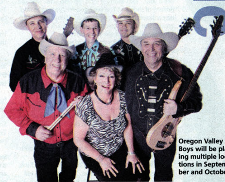
Oregon Valley Boys will be playing multiple locations in September and October.

Hill has background in blues and country, but he